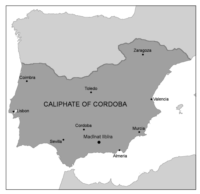
Fig. 1. Location of Madīnat Ilbīra on map of the Caliphate of Córdoba, c. 1000 AD \,

carried out to date allow us to state that it was established no later than around the mid-9<sup>th</sup> century, whereas the period of its depopulation and decline dates to around the mid-11<sup>th</sup> century and is associated with the downfall of the Caliphate of Córdoba (Malpica Cuello, 2011, 2012a; Espinar Moreno, 2016), when the main economic and administrative centre of that region became neighbouring Granada.