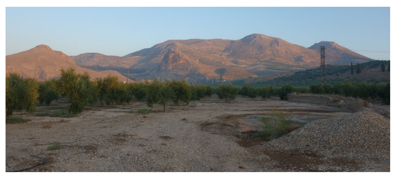
Fig. 3. View of the area of the site situated at the foot of Sierra Elvira. On the slope of El Sombrerete hill (left), remains of the citadel were identified.

of the Caliphate of Córdoba, and depopulation of the town proceeded several decades after its downfall and the emergence of the new urban centre in nearby Granada. It was also established that some sort of settlement, most probably of rural character, existed at the site of the former town at the end of the Middle Ages, most probably in the 13^{\rm th}-14^{\rm th} centuries.