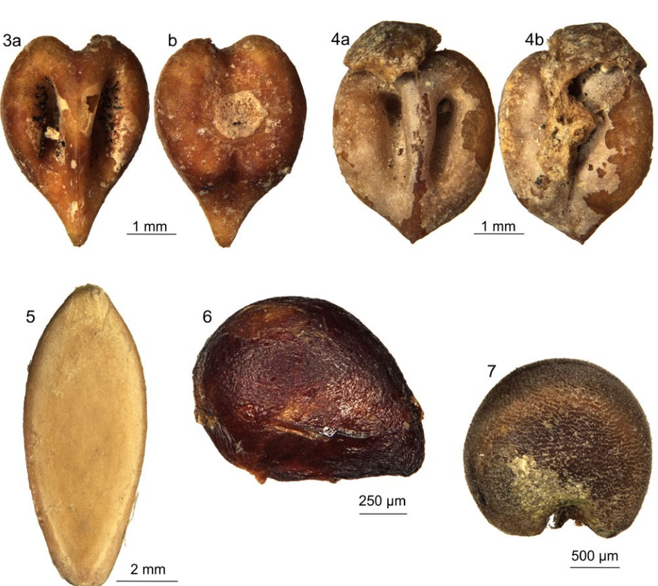
Plate 1 . Macroscopic plant remains from Madīnat Ilbīra. 1. Triticum aestivum or T. durum – caryopsis, a. dorsal view, b. ventral view; 2. Triticum dicoccon – basal part of spikelet; 3, 4. Vitis vinifera subsp. Vinifera – pipes, a, b. fruit-stone from both sides (two specimens); 5. Cucumis sativus vel C. melo ; 6. Fragaria vesca ; 7. Malva sylvestris

mentioned above, it is not possible to determine which of the two species was preserved at the site. Arabic medical treatises suggest the presence of cucumbers in Spain by the mid-9<sup>th</sup> century (Paris et al., 2012), although recently it has been suggested that this information actually refers to another fruit from the Cucurbitaceae family – C. melo (Zohary et al., 2012: 155). The latter has been recorded in archaeological material from the Bronze Age in Egypt, Greece, and Mesopotamia (Zohary et al., 2012: 155). Whichever of those plants was preserved in the analysed material, they both produced large, watery, ready-to-eat fruit.