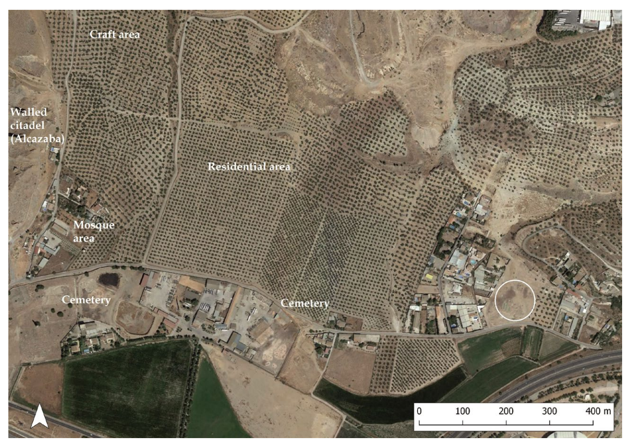
Fig. 2. Location of the recognized spatial elements of medieval Madīnat Ilbīra, according to Malpica Cuello, 2012c. The excavation area within the assumed Mozarab district is circled