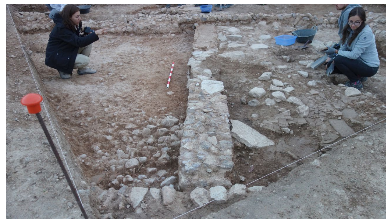
Fig. 4. Exploration of remains of a building structure dated to the end of the 10<sup>th</sup> century.

only a few of them were collected from wells related to the qanat system. Each sample, which ranged in volume from 0.5 l to 10 l, was subjected to flotation; the light fraction was repeatedly separated and collected using 0.2 mm and 0.5 mm sieves. The two fractions obtained through water sieving were separated while still wet with the use of a low-power stereomicroscope at 10 \times magnification. Then all organic remains were removed and segregated. Fruit and seeds, numerous wood fragments, vegetative parts of plants, snail shells and small bone fragments were then identified in the material. Only one sample (Inv. GR-MI-18 III 42.037a), which came from the fill of an access shaft of the qanat irrigation system, did not contain any plant remains. One sample (Inv. GR-MI-19 III 41.120) contained contemporary contamination in the form of uncharred caryopses of grasses (Poaceae indet.) and fruit of Viola sp. which began to germinate several days after being watered (Lityńska-Zając and Wasylikowa, 2005: 41, 42). That sample came from a stratigraphic unit that was partly damaged by modern human activity.